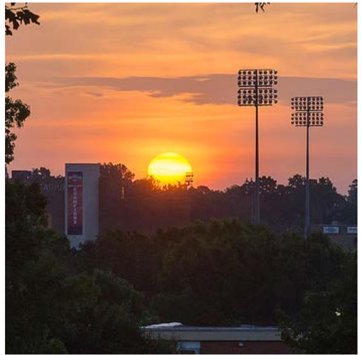
After Hours Resources