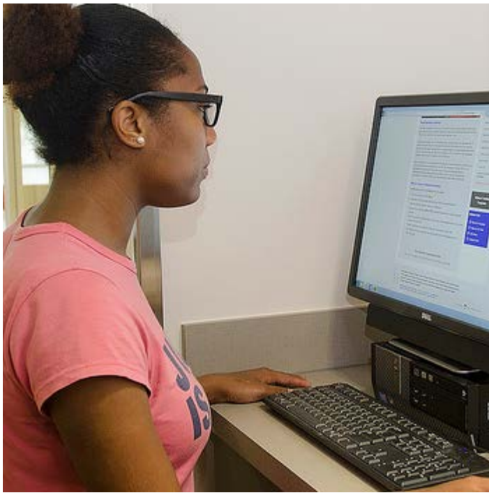
Patient Portal Login